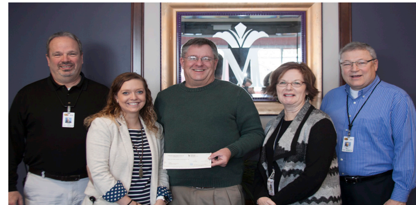
Thank you to the Mystique Casino Employee Group